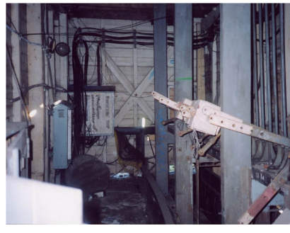
The ground floor weights

'C1863. Midland Railway signal box of three bay type. Timber framed with weatherboarded ground floor, outer bays containing small framed windows. 1st floor fully glazed with two bays of 3 lights and one bay of 2 lights: small paned sliding casement windows. Hipped slate roof. Wooden flight of steps with plain banisters give access across to first floor side entrance. Iron bracketed balcony to front. This is a good unaltered example of a 3 bay Midland Railway Signal box contemporary with the opening of the main line through to St Pancras.'