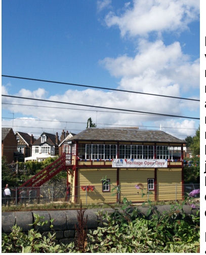
The Box open for visitors on the Sunday of Heritage Open Weekend.

Many of our visitors on the Sunday of Heritage Open Weekend in September had previously visited the old cinema in London Road to look at its present state prior to its forthcoming restoration. During their visit they learnt that the cinema is to be known as 'The Odyssey' when it reopens. This set me wondering how much this title also related to the signal box. Wikipedia advises that 'in the English language as well as many others, the word odyssey has come to refer to an epic voyage'. Well our experiences since 2002 have certainly been epic! However, more to the point, the cinema website says that 'The Odyssey is not only a reference to film by honouring one of the world's greatest filmmakers, but it describes the <u>quest, adventure and journey into the knowingly hazardous labyrinth of restoration</u>'. That last phrase definitely rings bells for us and describes the twists and turns of our adventure and the trials and tribulations of dealing with the various authorities and the sheer effort required along the way. Hopefully the outcome for the cinema will be as successful as our odyssey has turned out to be.