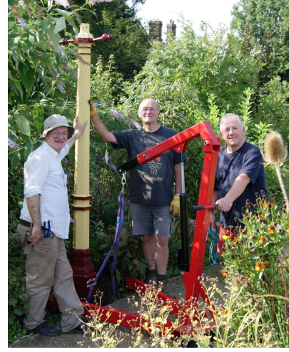
Our second Midland Railway lamp post has now been planted in the garden.

The new merchandise consists of a St Albans Signal Box 2011 calendar (a must have!) and 2 new Dapol OO wagons. The calendar (see over) is A4 size with a page per month. Each page consists of a picture of the Signal Box or the gardens or artefacts (half page) with the remaining half page for the dates. There is room to write a note on each day. All the photographs have been taken by members. The calendars are priced at £7.50 each with a 10% discount for purchases of 5 or more. A year round reminder of our achievements.