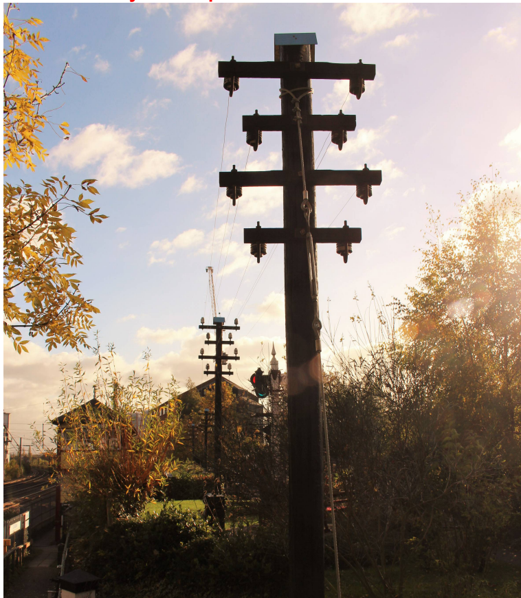
Below: The new telegraph poles erected in the garden and now almost fully wired up.